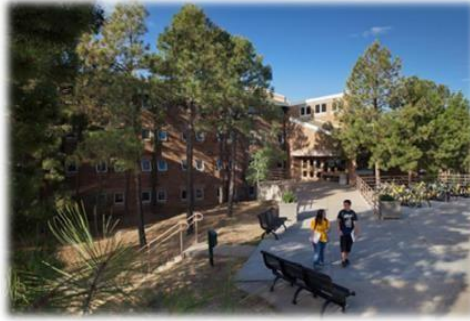
Gabaldon Suite Style Room 3D/VR Walkthrough

The large yet cozy suite-style rooms make the hall warm and personable with numerous study rooms. The hall sits in a beautiful wooded area, giving it a warm, cabin-like atmosphere.